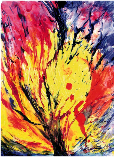
Helga Weule · Fire tree 1997