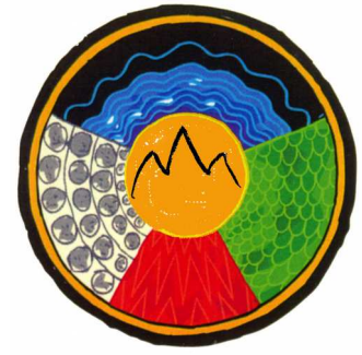
Dagara medicine wheel

The fascination of all forms of constellation work lies in its emotional impact on those involved and in drawing from an unknown knowledge in the constellation space. Emergence of feelings and temporary letting go of the