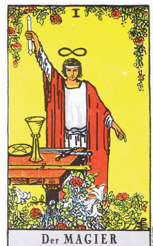
Tarot (Rider/Smith, former Rider/Waite)

- Promotion of intuition and creativity and of the art of prescribing rituals based on the cases.