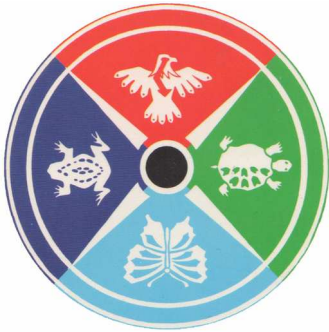
Medicine wheel Bear tribe (Sun Bear)