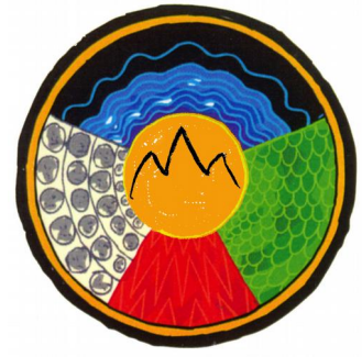
Dagara medicine wheel

The fascination of all forms of constellation work lies in its emotional impact on those involved and in drawing from an unknown knowledge in the constellation space.