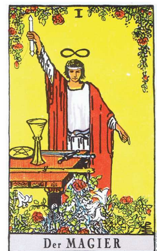
Tarot (Rider/Smith, former Rider/Waite)

- Promotion of intuition and creativity and of the art of prescribing rituals based on the cases.